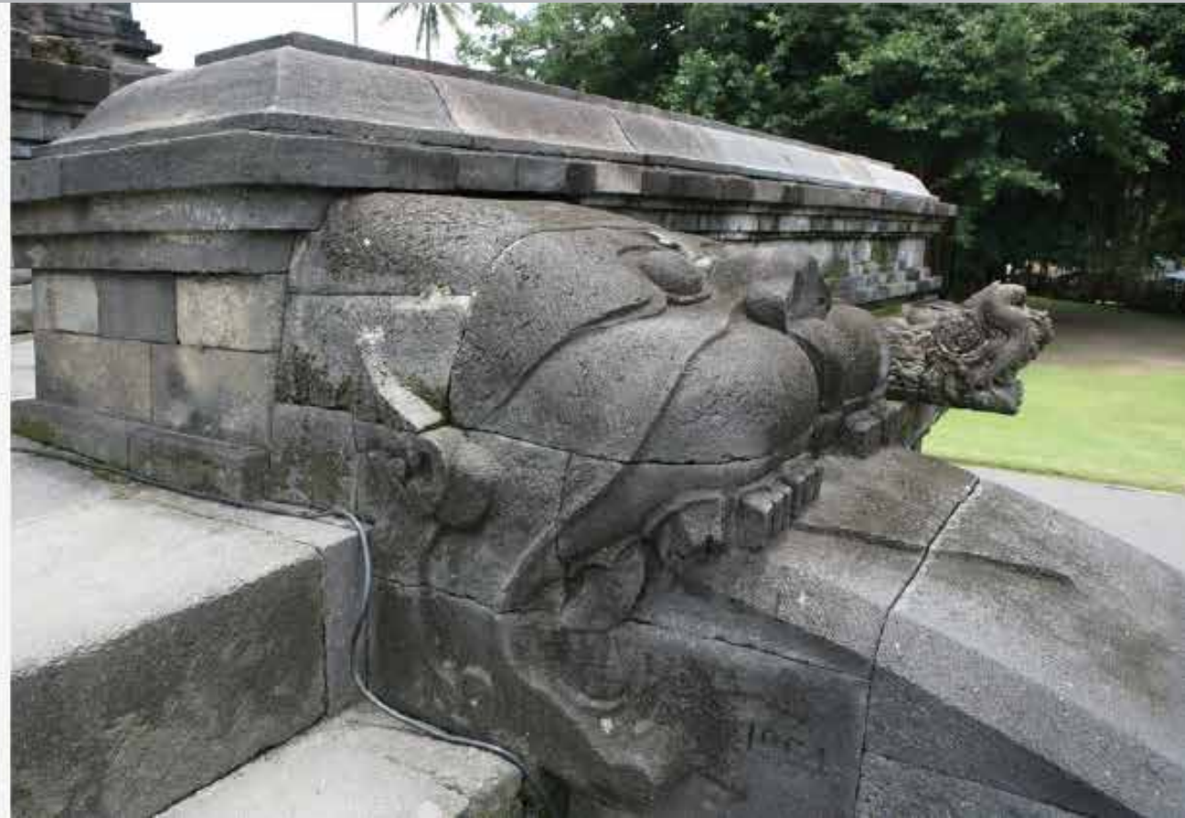
Balustrades at Chandi (temple) Mendut, part of the Borobudur complex in central Java