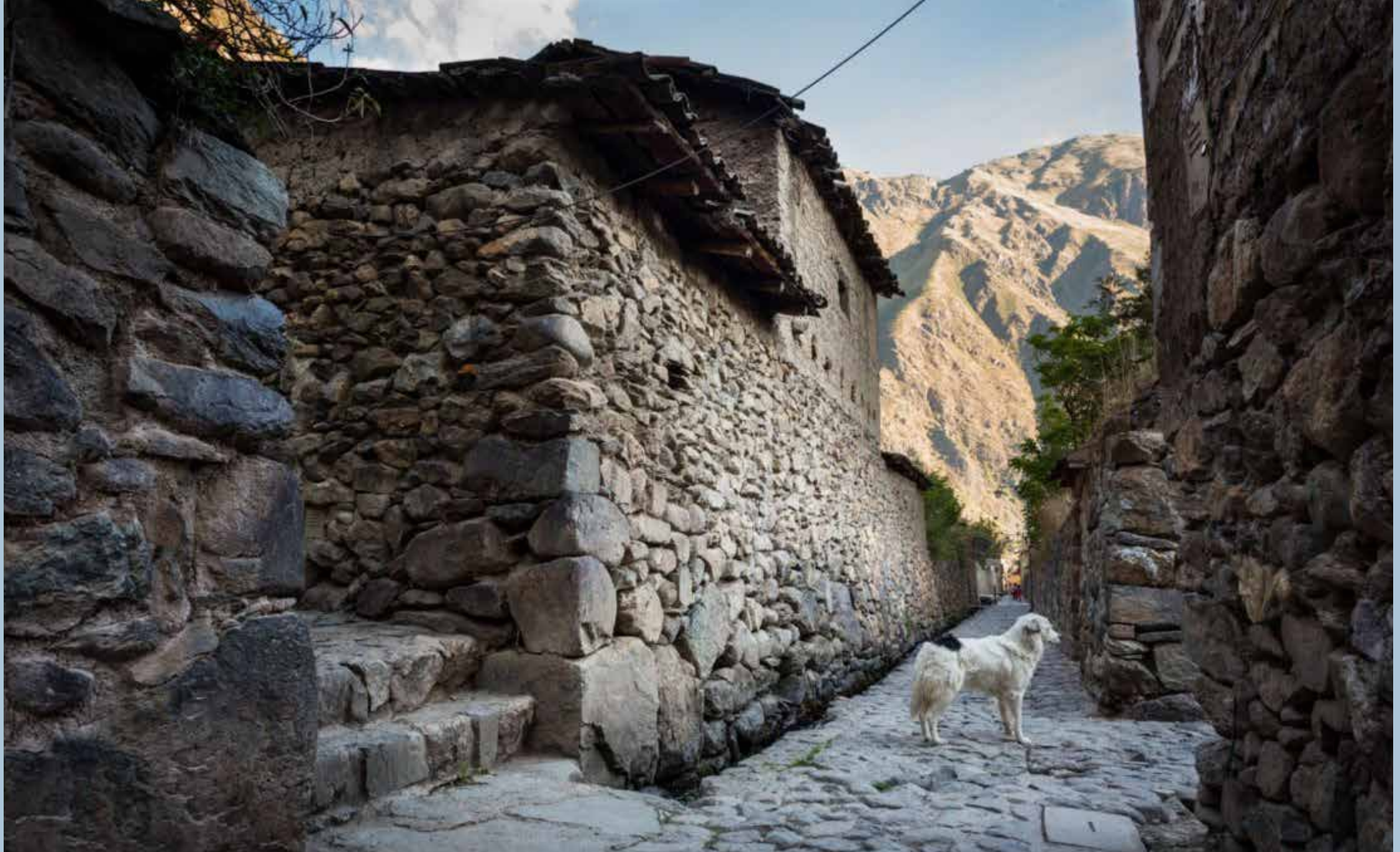
Street scene in the town of Ollantaytambo