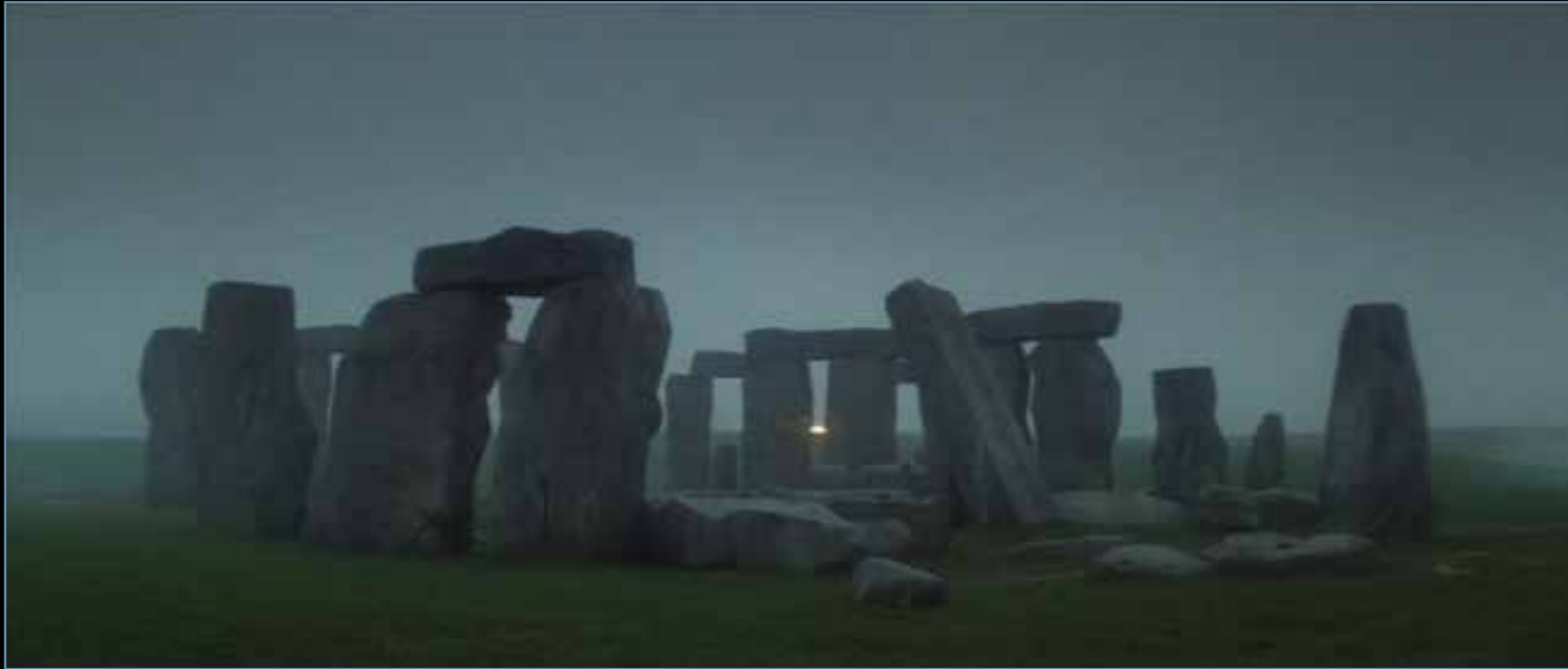
Still from Still from Roman Polanski's 1979 film TESS