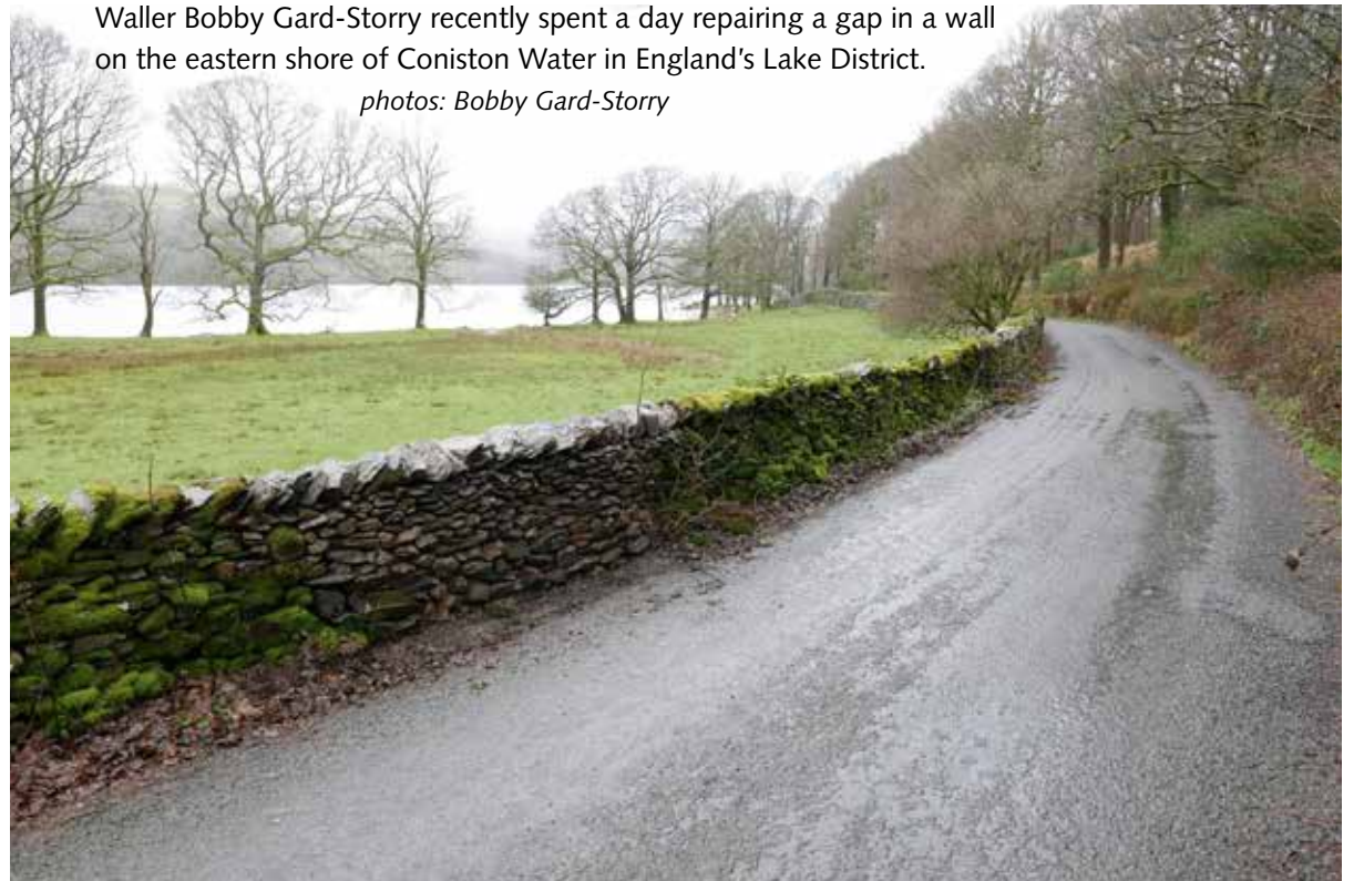
Waller Bobby Gard-Storry recently spent a day repairing a gap in a wall on the eastern shore of Coniston Water in England's Lake District.