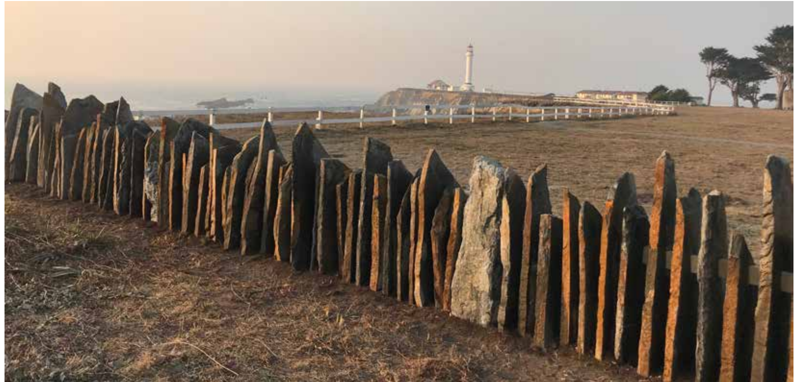
JOHN SHAW-RIMMINGTON, Port Hope, Ontario