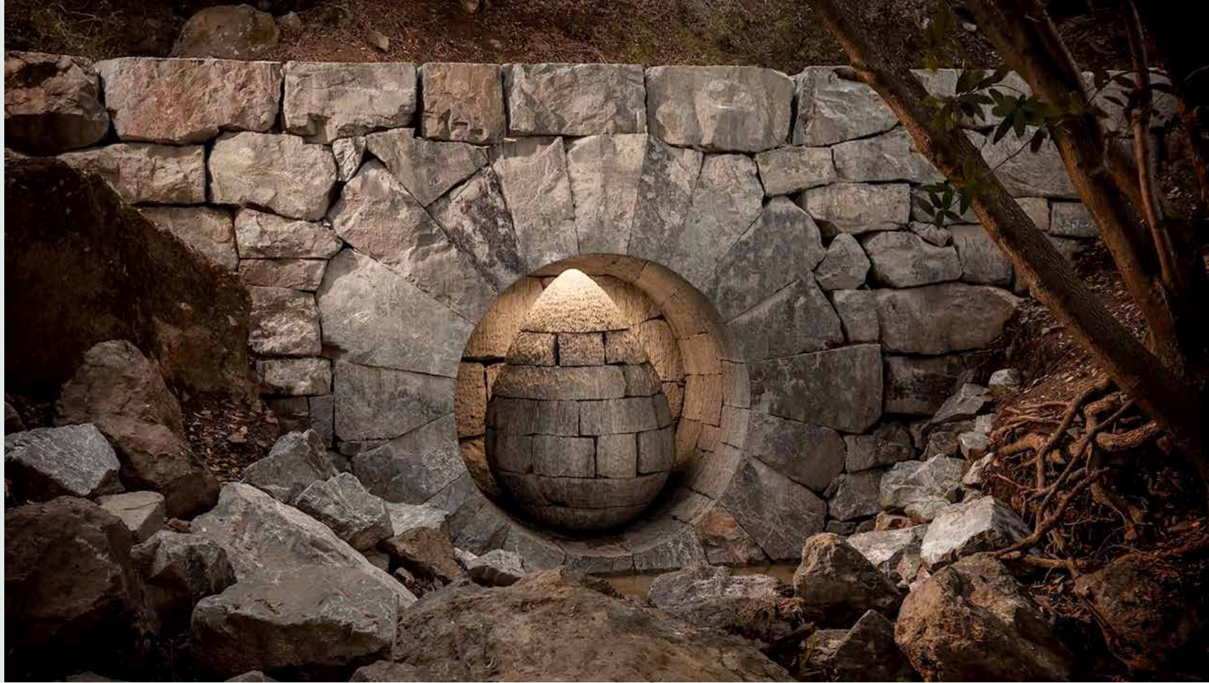
The Making of Andy Goldsworthy's CULVERT CAIRN